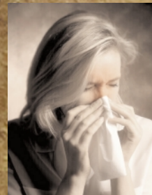
The symptoms you get from slicing an onion are similar to those of hay fever.

Have you ever sliced an onion and noticed that your eyes start to water and your nose starts to run? These symptoms are similar to those suffering from hay fever. If you give someone with hay fever a homeopathic preparation containing a minute amount of onion, his or her symptoms often clear up! Like cures like. That's the whole idea behind homeopathic "remedies."